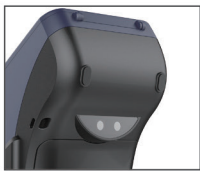
1D 2D Barcode Scanner