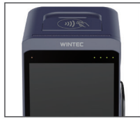
Contactless Card Reader